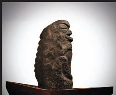
'Man Turned to Stone'