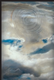
Betty Goodwin 'Beyond Chaos No.7'